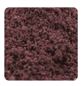
Palm Kernel Expeller