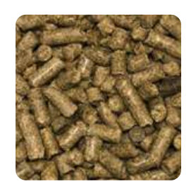
High Fiber Pellets