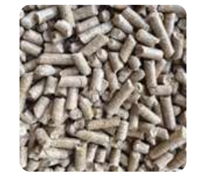
Rice Husk Pellets