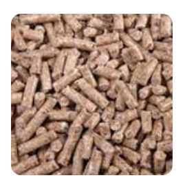
Wheat Bran Pellets