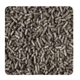
Sugar Beet Pulp

Origins: France, Serbia, Germany, Austria, Croatia, Russia, Egypt