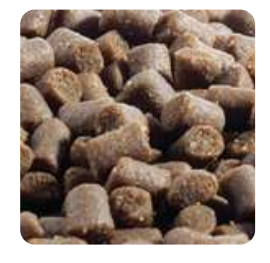
Fish Meal Pellets