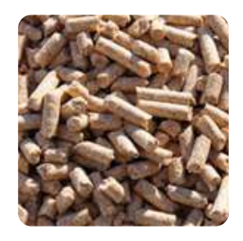
Compound Commodity Pellets

Origins: Vietnam, Italy, Spain Made to Order Per Customer Needs